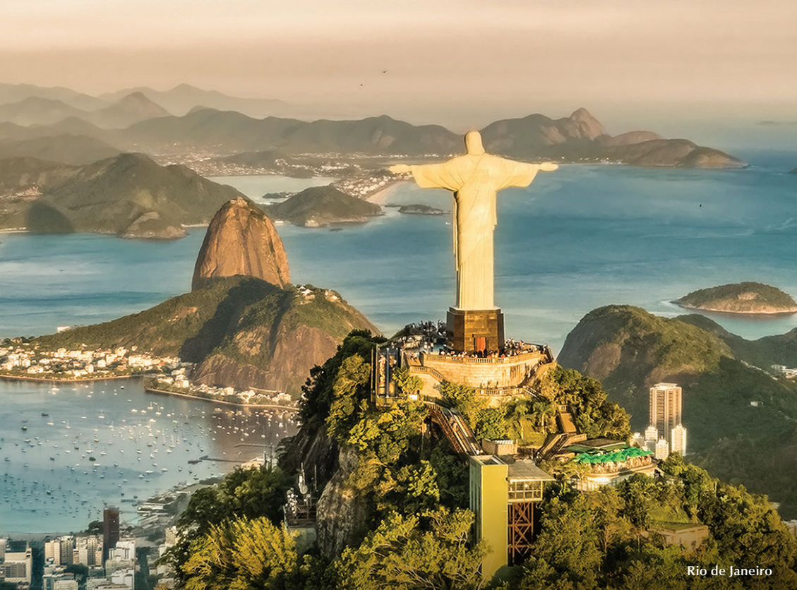
Rio de Janeiro